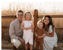
Freyer Family New Zealand