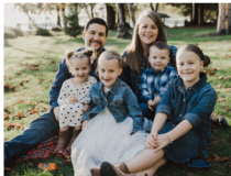
Towns Family North Vancouver, BC