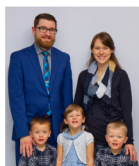
Coates Family Quebec