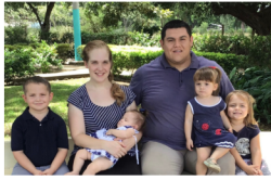
Portillo Family Nicaragua