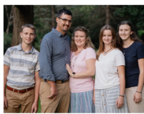
Dinsmore Family Belize