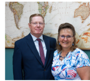
Price Family FirstBible International