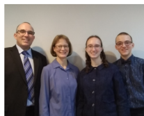
Burns Family Quebec