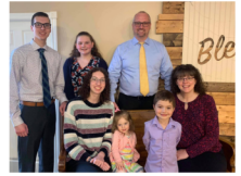
Stansford Family Newfoundland