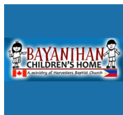
Bayanihan Children's Home Philippines