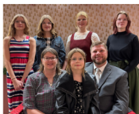
Bueckert Family Calgary, BC