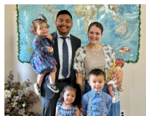
Galindez Family Porcupine Plain, SK