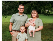
Turner Family Uganda