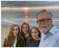
Kamps Family Netherlands