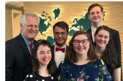
Young Family Russia