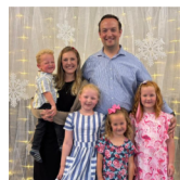
Hutchens Family New Zealand