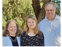
Lester Family Australia