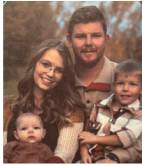
Neufeld Family India